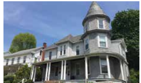
Tenants and Landlords